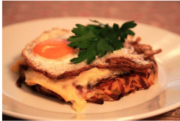
Bernese Roesti with bacon and fried egg and scalloped with cheese 28.90